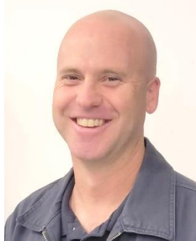
The 4-Way Test