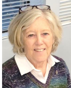
Thought for the Day