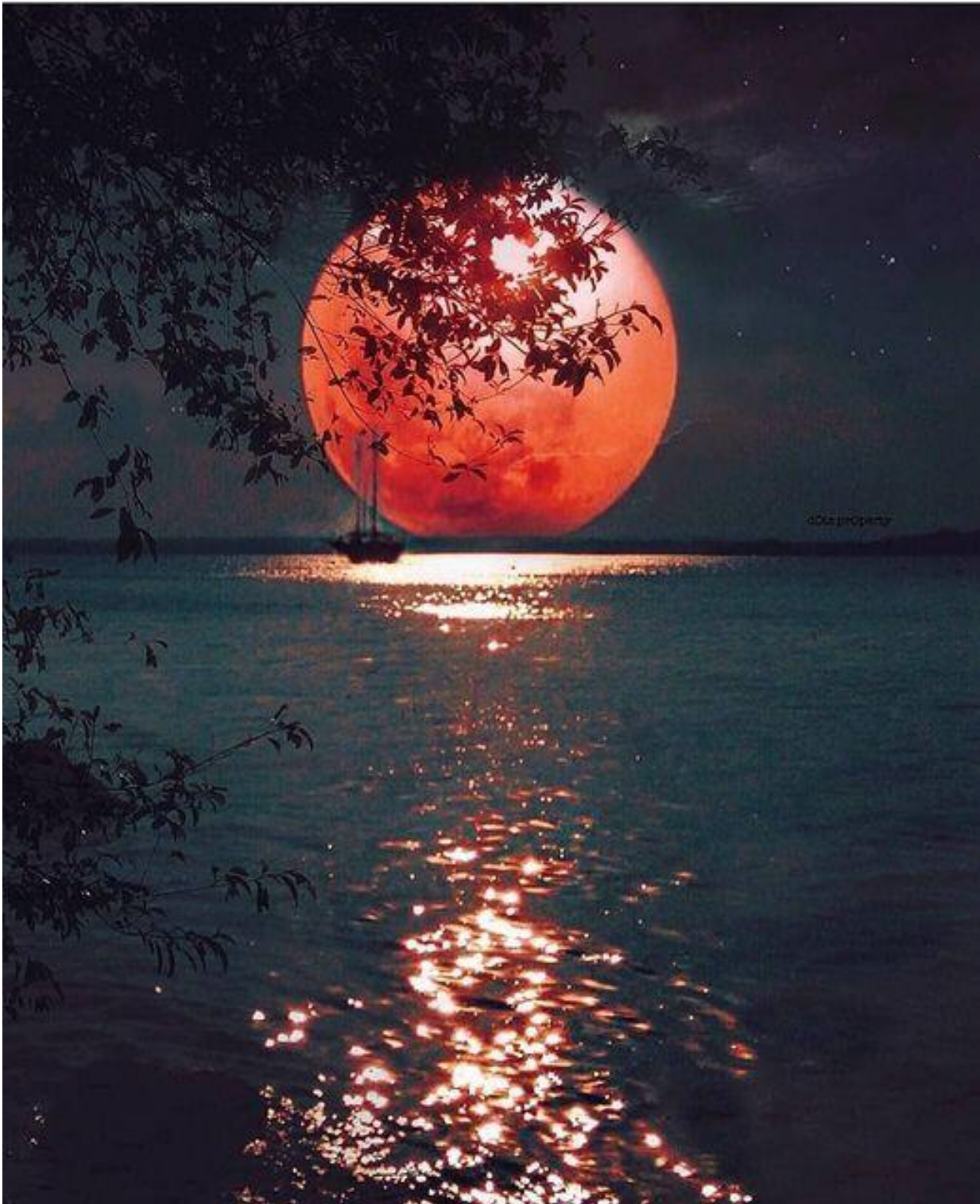
Breath-taking full moon