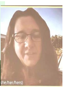
GIRL SCOUTS OF AMERICA TROOP32379