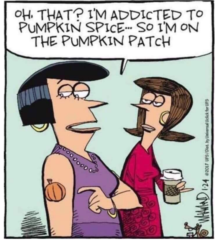
FIGURE THESE OUT